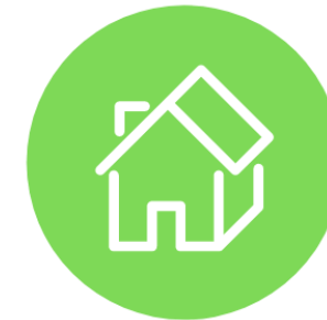
Difficulties Relating to Employment and Housing