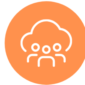
Pre-Departure Arrangement and Cultural Orientation Sessions