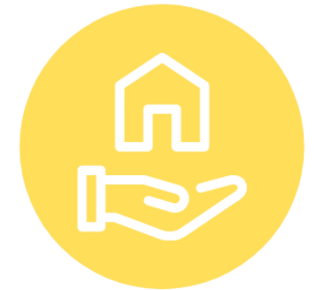
Reception and Placement (Housing)