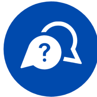
The Selection Phase - Eligibility for Resettlement (Interview)