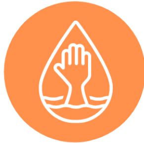
Lack of Support Network